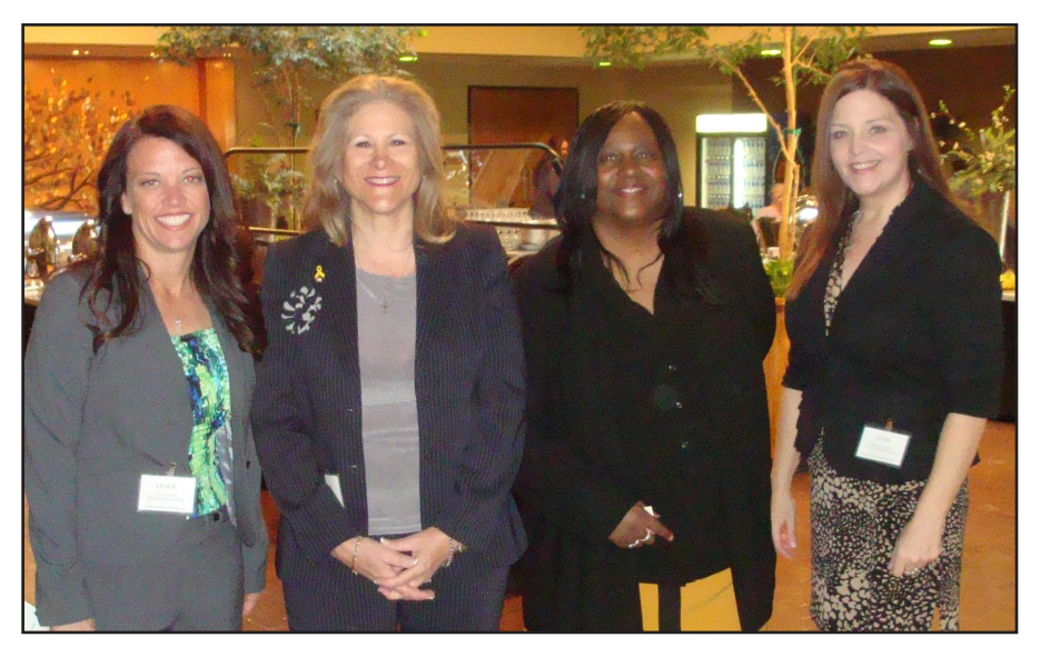
OPG Team Attended the 2013 Symposium

As of June 30, 2013, the individuals participating in the statewide self-exclusion program numbered 2,863; it is administered by the Arizona Department of Gaming and Arizona's Indian Tribes with casinos. An analysis of the data over the last ten years shows that despite most people selecting the one year duration, the static nature of the ten-year total appears to dominate the other pieces of the pie chart. The first expirations of the ten-year self-exclusions began in April 2013.